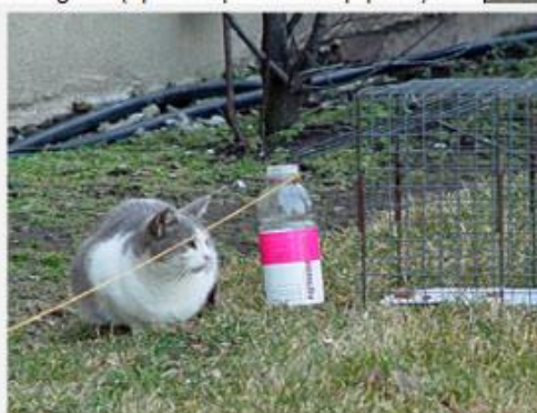
PHOTO 1: Notice that the string is taut and ready to be pulled. This way it will not distract the cat in the trap as the string is pulled. They can be out and gone before you even get the string straight and taut. Some people tie the string to the bottom of the bottle for less of a visual distraction.